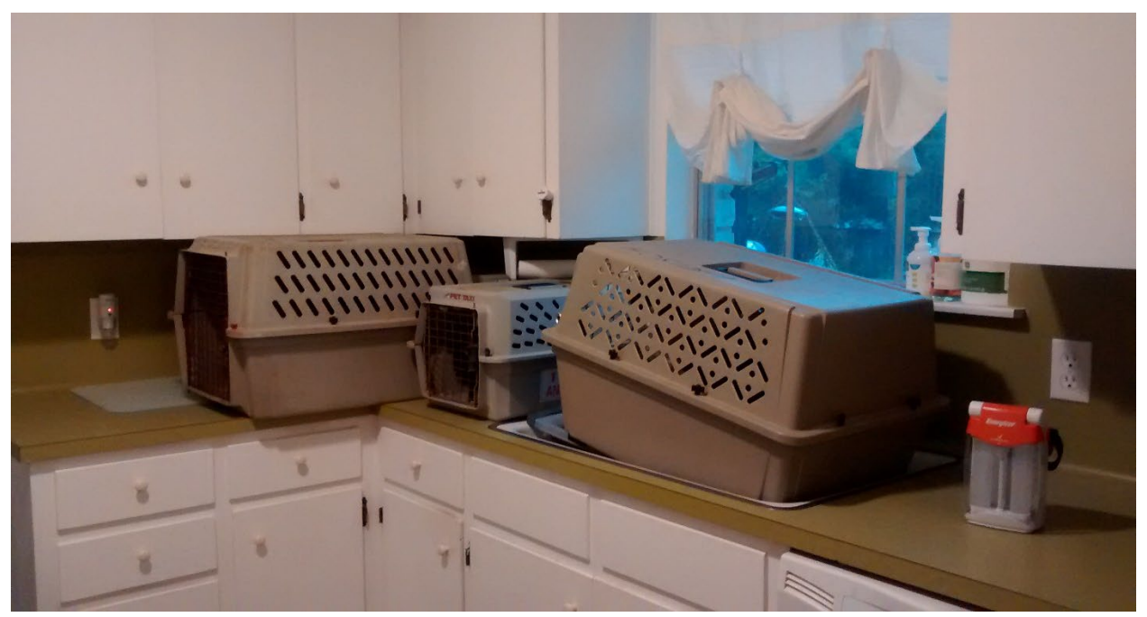
You might be familiar with the reminder, "Keys, wallet, phone." Similarly, for your pet's evacuation plan, think PET : Prescriptions , Essentials , Tails . This will help ensure you have everything your pet needs in an emergency.